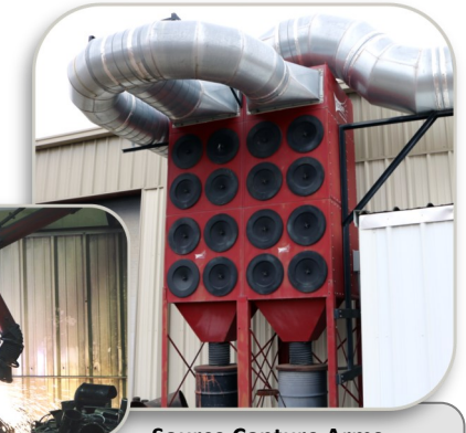
Source Capture Arms ducted to central system located outdoors returns clean, heated/cooled air to facility.