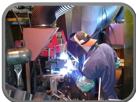
Work Area After Source Capture of Weld Smoke and Fumes

Metal dust particles in welding fumes are a leading cause of eye irritation in factories. Metal dust also can cause upper respiratory irritation with black material being coughed and sneezed from workers who are exposed to welding fumes. Metal dust particles are also known to cause headaches.