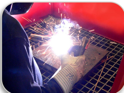
Smoke and fumes pulled away from worker breathing / vision zones.