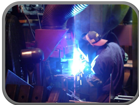
Work Area Prior to Source Capture of Weld Smoke and Fumes

Overexposure to weld smoke and fumes can cause a wide range of health problems.