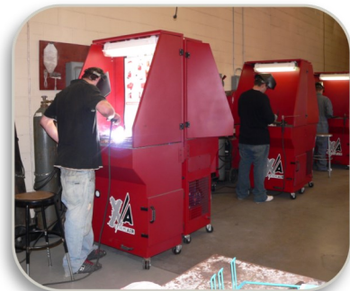
Downdraft Tables provide source capture of weld smoke and fumes.

Keeping weld fumes under control is necessary for, not only regulatory compliance, but for employee safety and health. Good indoor air cleaning also prevents buildup of nuisance dust on electrical components, machinery and employee work stations.