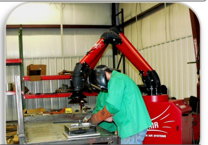
Portable TM1000 cartridge collector with source capture arm.