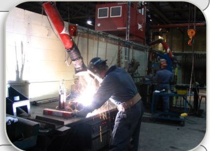
Source Capture Arms ducted to ceiling hung cartridge collector.