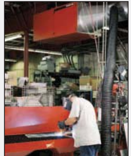
Easily ducted to existing filtration.