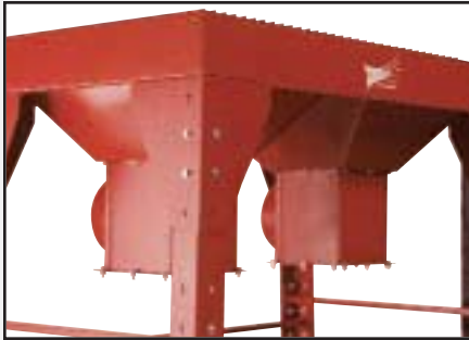
Optional horizontal transitions