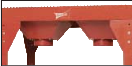
Optional square to round flanges