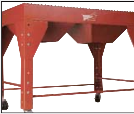
Standard hopper discharge