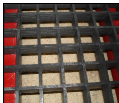
Spark Arresting Sand Trays—Optional